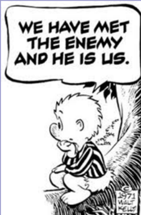
Walt Kelly's 'Pogo'

The Teabaggers have absconded with the VIP status of Garland County and Hot Springs politics and government. These rowdies snuck up on us. We let them. The warning signs were there. We laughed; we joked; we thought they'd fizzle out. We were wrong; they are winning. We were passive. We continue to be passive. How are we not responding to the Teaparty crisis? Let us count the ways. Democrats are: Not in attendance at county government meetings; Missing in action at city government meetings; Not attending Democratic meetings; Leaving the few remaining Democrats in office in the lurch, out on the limb; Giving meager campaign donations to Democratic candidates; Squabbling among ourselves; Not speaking up; Not writing letters to the editor; Throwing in the towel; Giving in to depression; Not aggressively confronting the Tea party squawks. The Tea party is forceful, even hostile, in city and county governmental meetings and in the